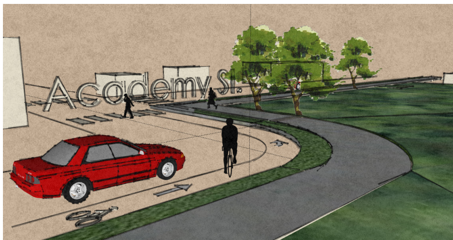
Possible configuration for the proposed street side trail and recommended cross walk on Dry Ave. at Academy St.