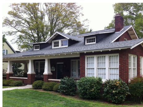
Existing single-family homes within the Town Center assessment area