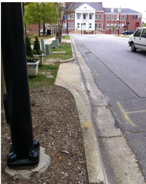
Existing conditions at and around the Central Park site