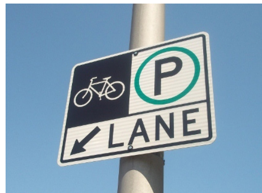
Bicycle Infrastructure that could be used to enhance the safety and connection within the Town