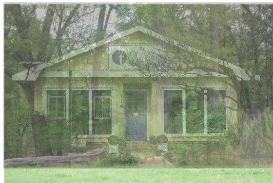
Image of structure in existing unimproved park

Finally, on the economic side, the Town should consider allowing for new construction on the periphery of the Park. New buildings should draw inspiration from the existing architecture within the Town Center, namely from the Historic District. These buildings can provide an opportunity for more boutique retail spaces, adding to the existing adaptively reused buildings along Academy Street, and thus creating a critical mass of small business. New development on the periphery can also house commercial or retail businesses geared towards outdoor activities such as equipment rentals, restaurants, ice cream parlors, etc. Finally, the site could house a new state of the art Library; replacing the existing one across the street and creating a attractive development opportunity in the heart of the Town Center.