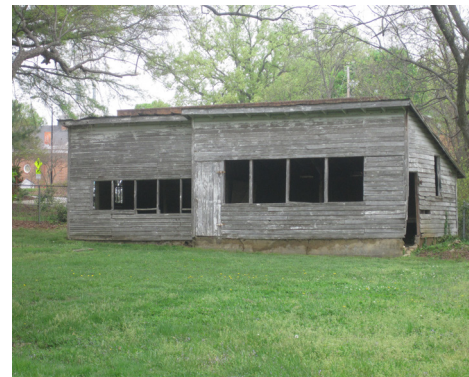
Existing building within the Town Center Park that could be rehabilitated