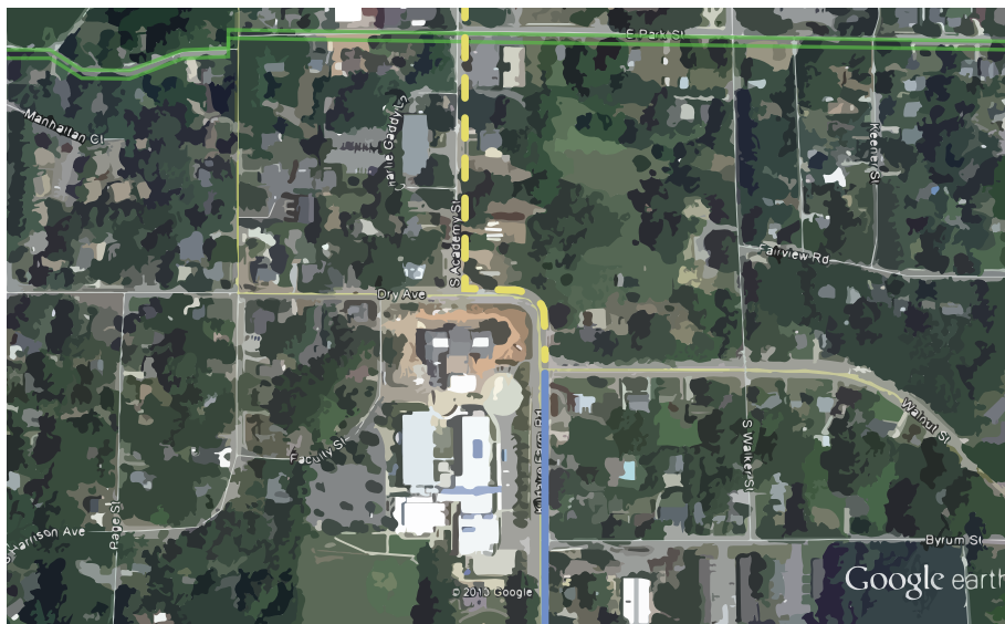
Existing Hike and Bike Map centered on the Town Center Site