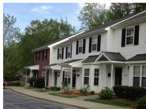
Multi-family homes outside of the Town Center assessment area