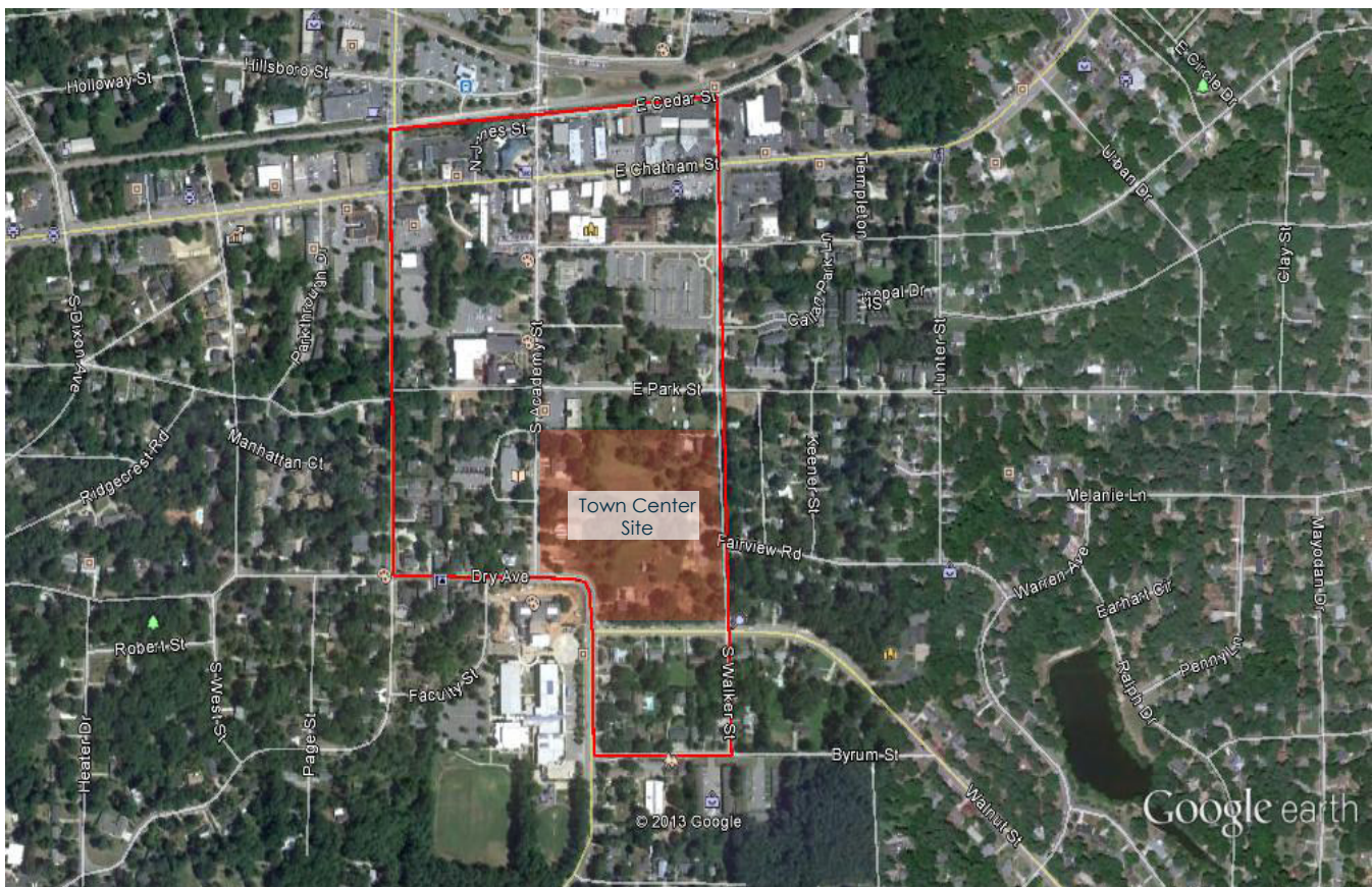
Town Center Neighborhood